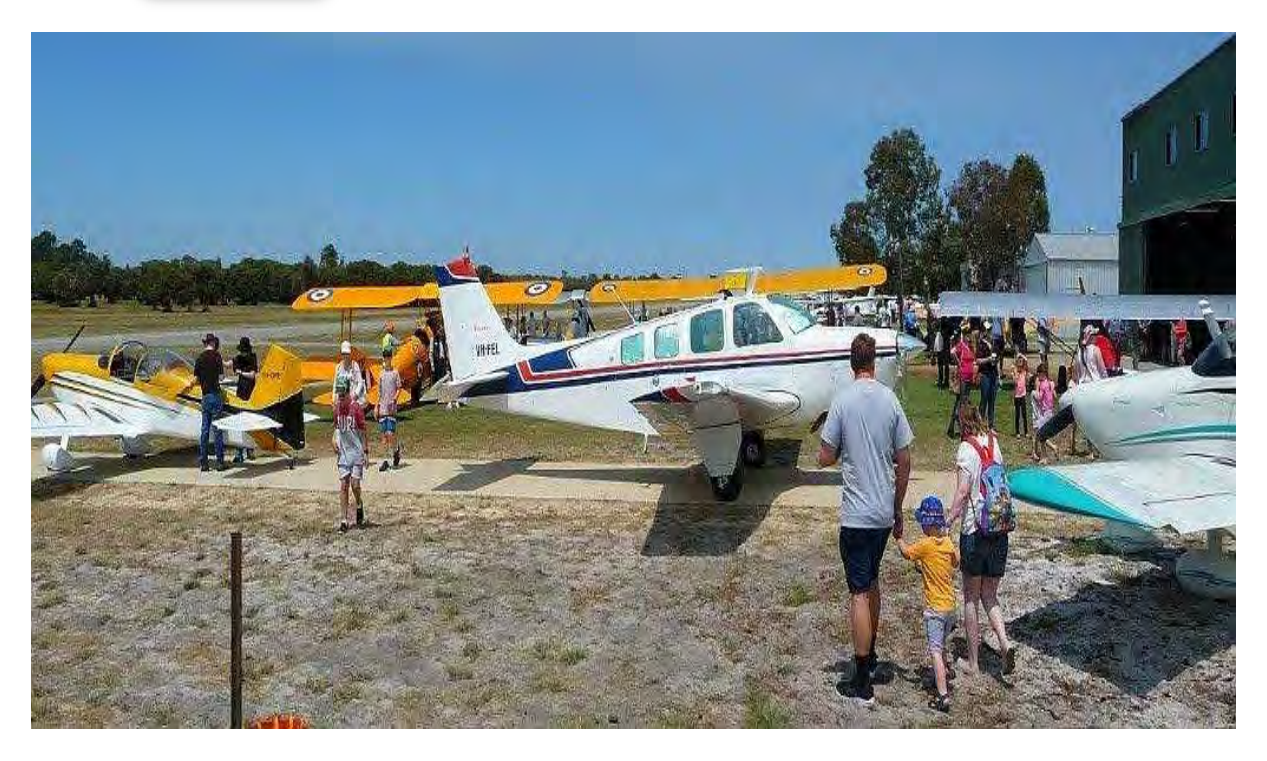
We enjoyed looking at the many types of aircraft on display and watched flying club member's planes taking off and landing at the airport.