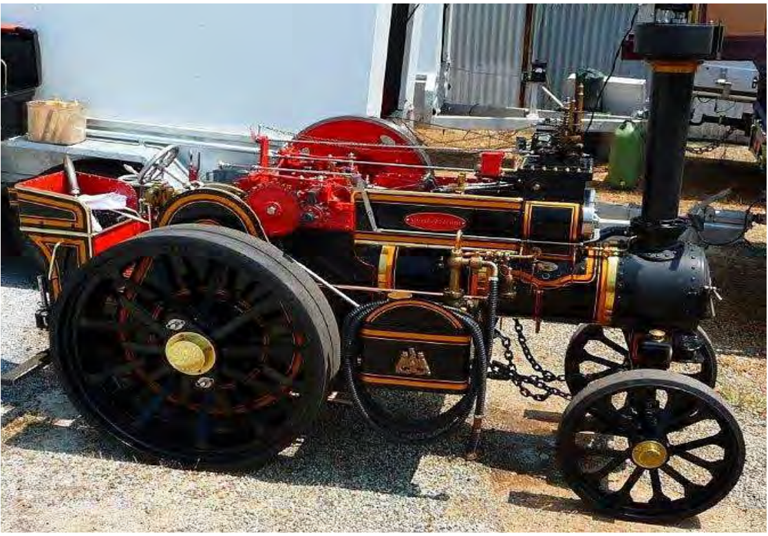
There was also working model steam powered tractors on display.