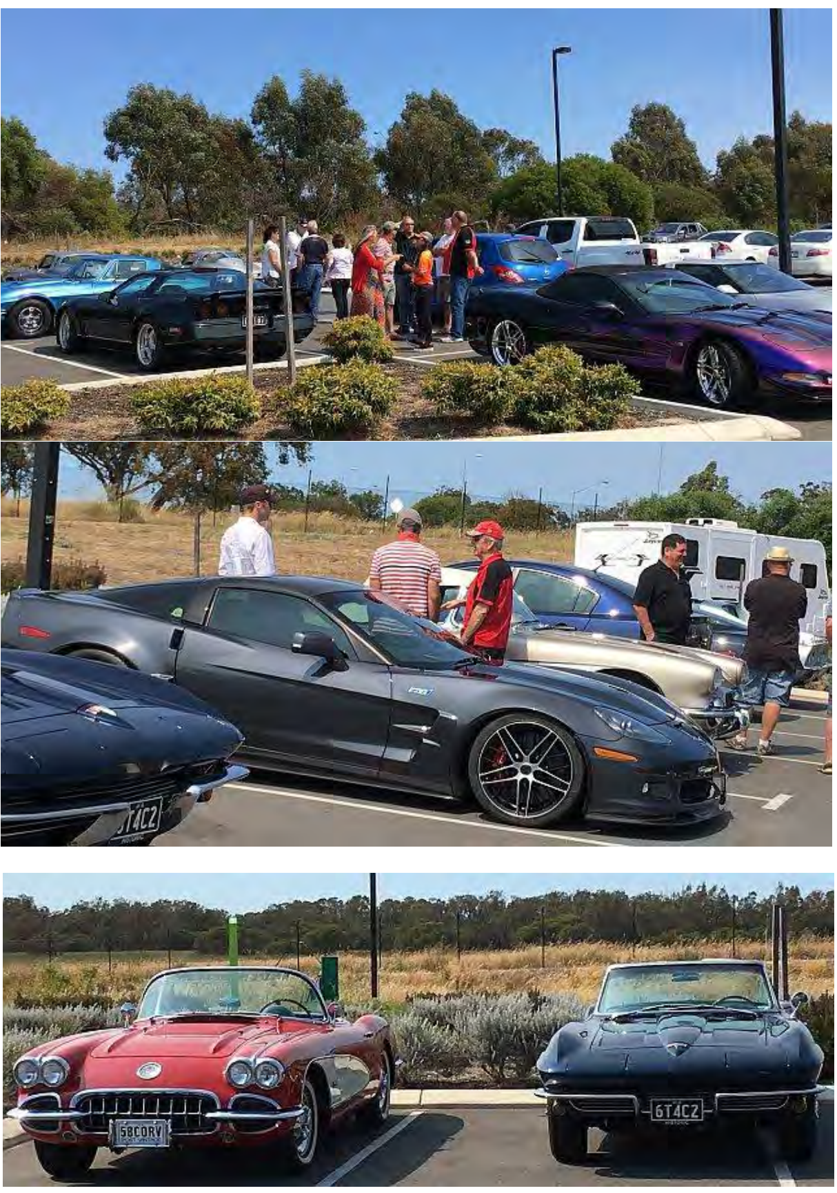
NCRS Members gathered with Corvettes of WA Members

November December Edition 2017 Page 33 of 48