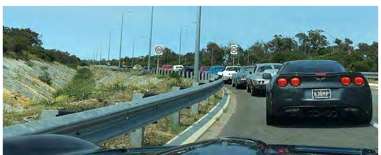
We cruised on in convey to the Serpentine Airfield