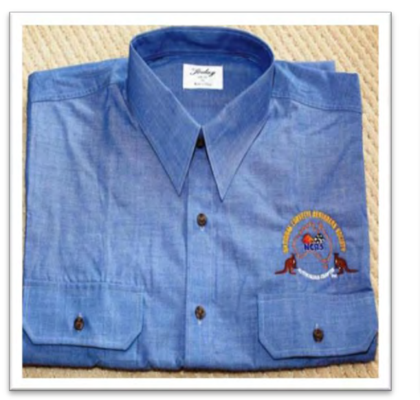
LADIES SHIRTS $ 35.00