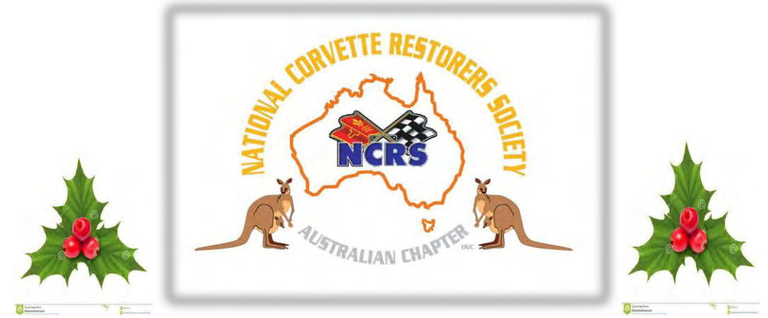
November December Edition 2017