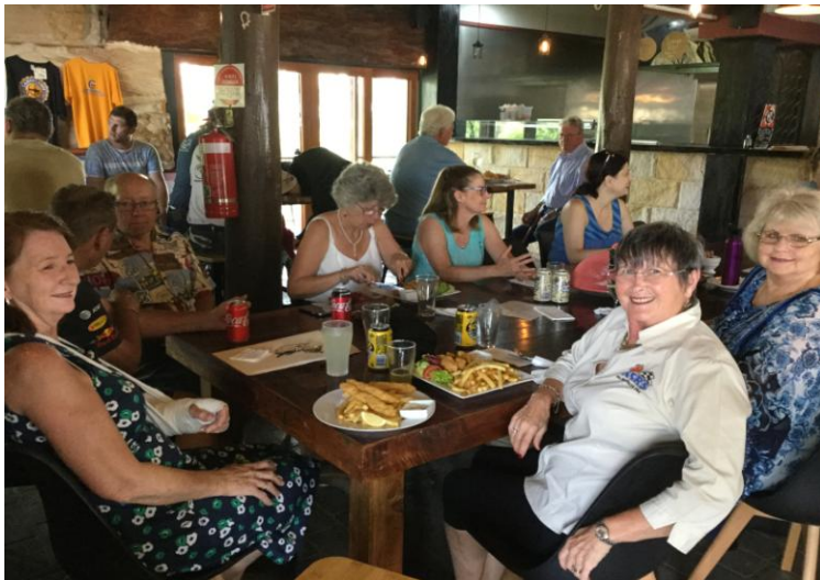
Everyone went quiet once the food arrived.