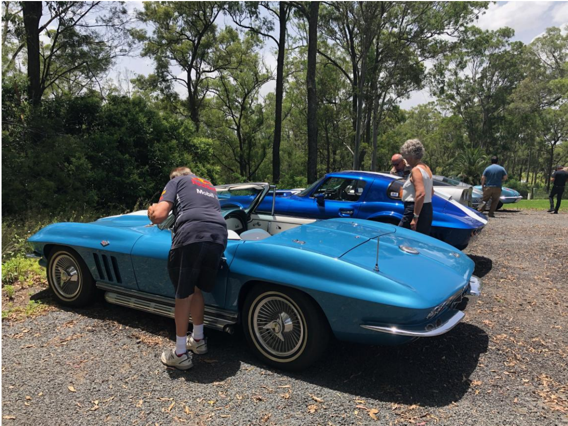
Clive's 66 Below waiting for the ferry to cross the Hawkesbury River.