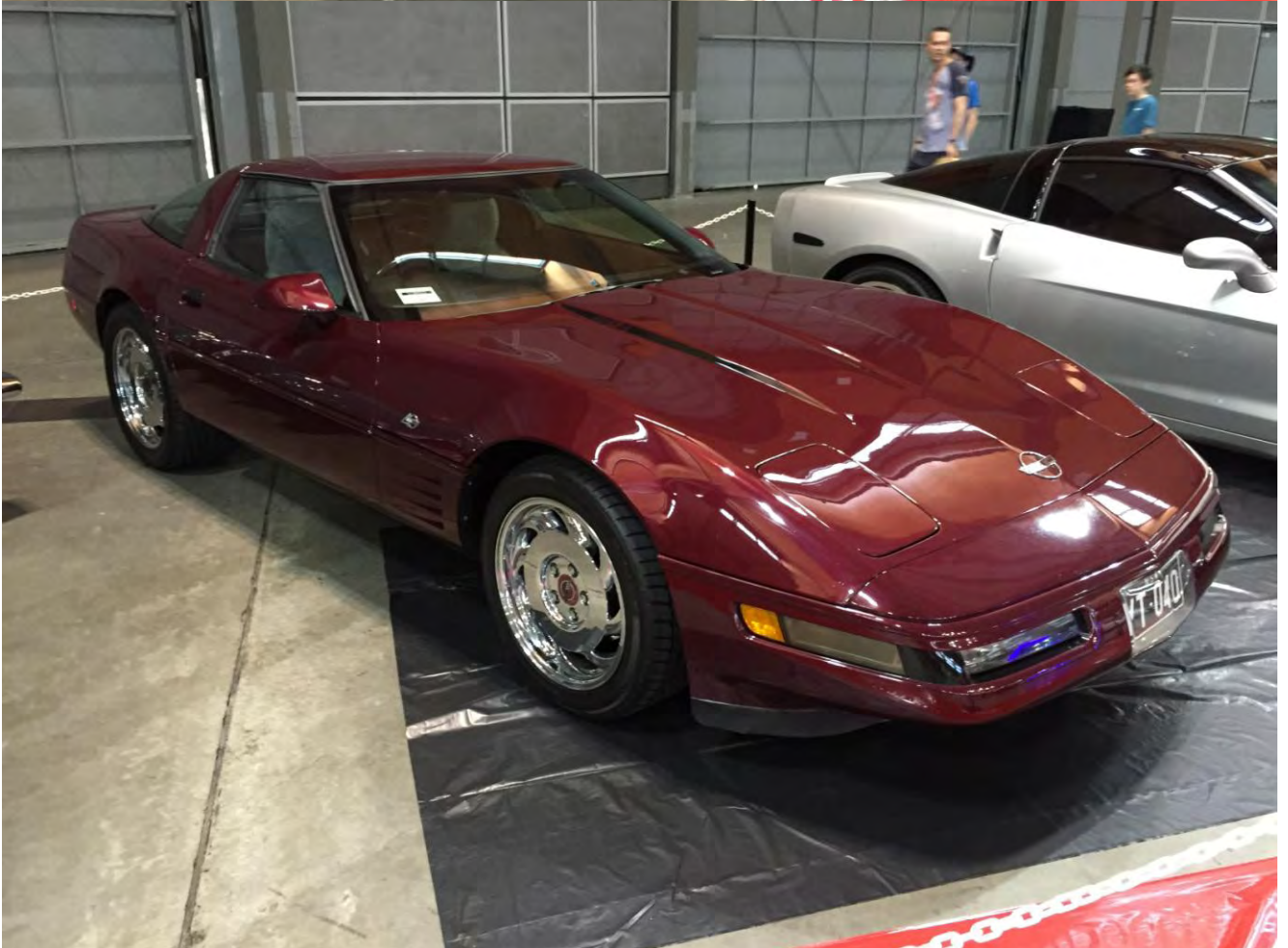
Brent Car's 58 looking fantastic as all ways and Ross's immaculate 93 C4