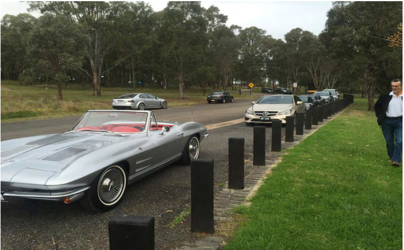
Rod's 1963 convertible