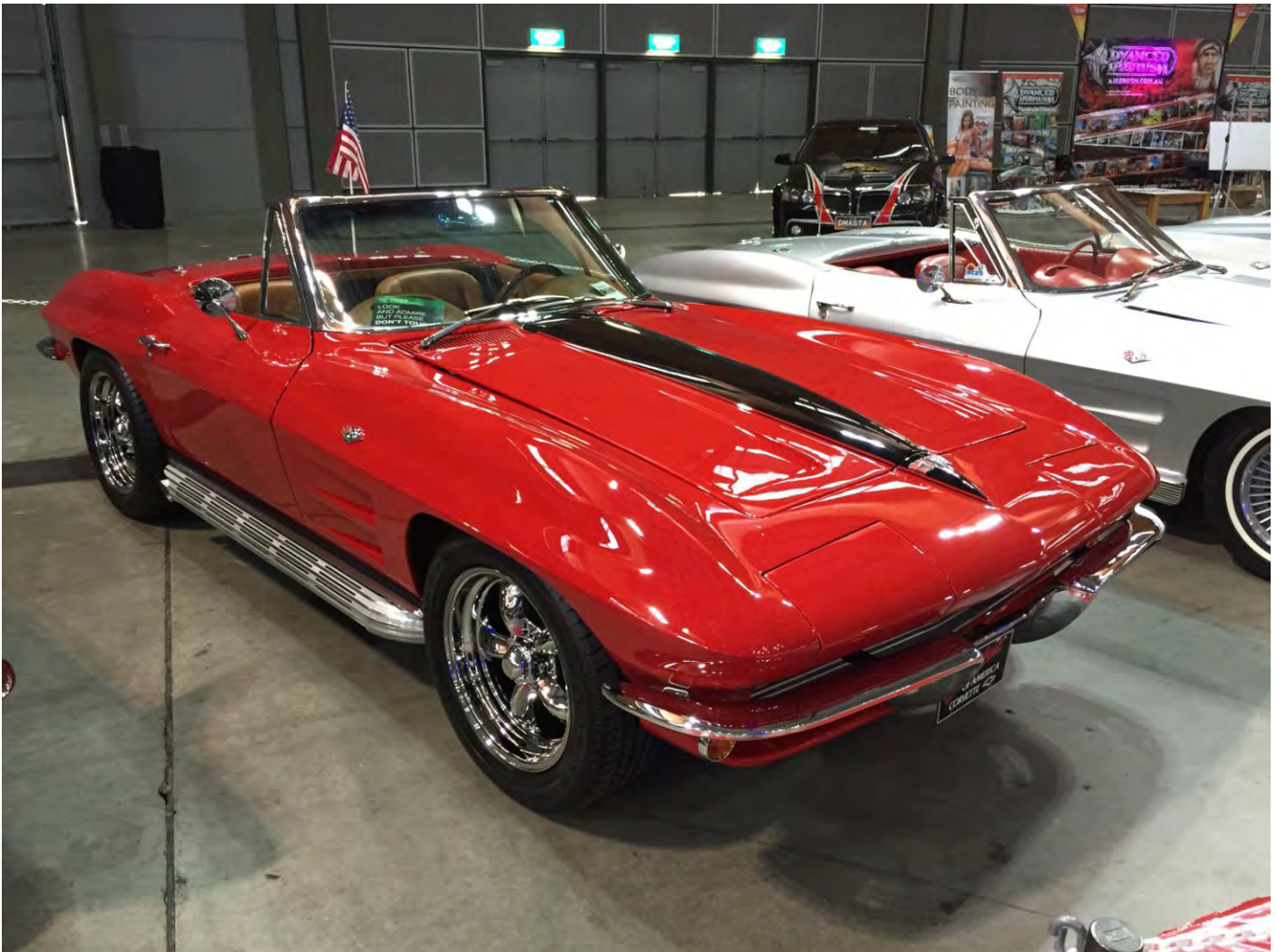
Bob's Great looking 64 Convertible