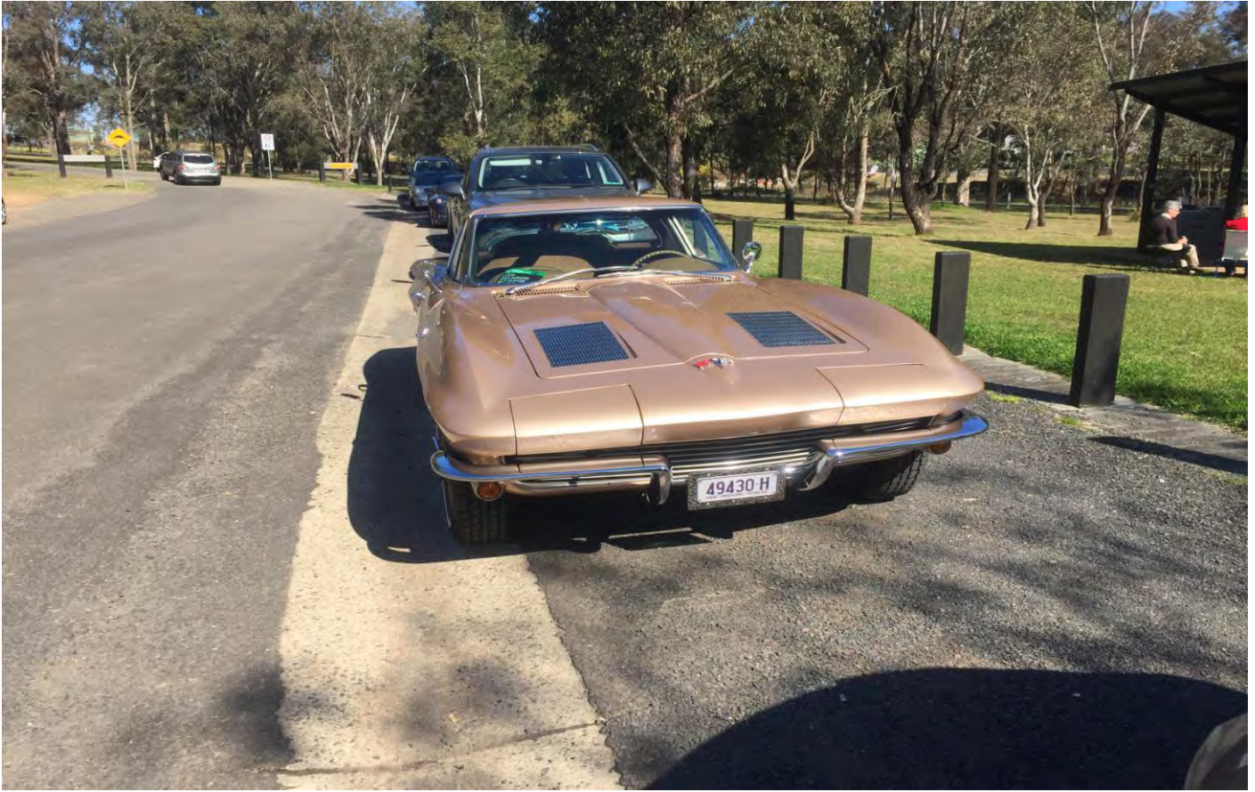
Clive's 1963 coupe