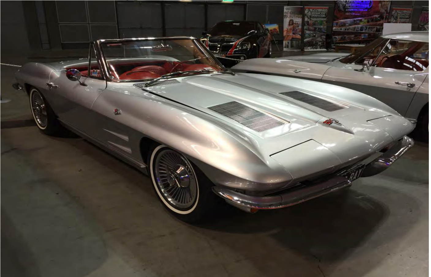
Rod's fantastic matching pair 63 Split Coupe and convertible well done