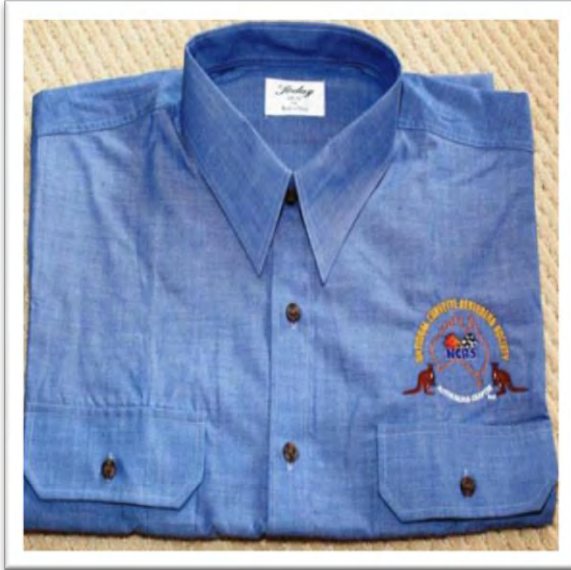
BLUE DENIM $35.00