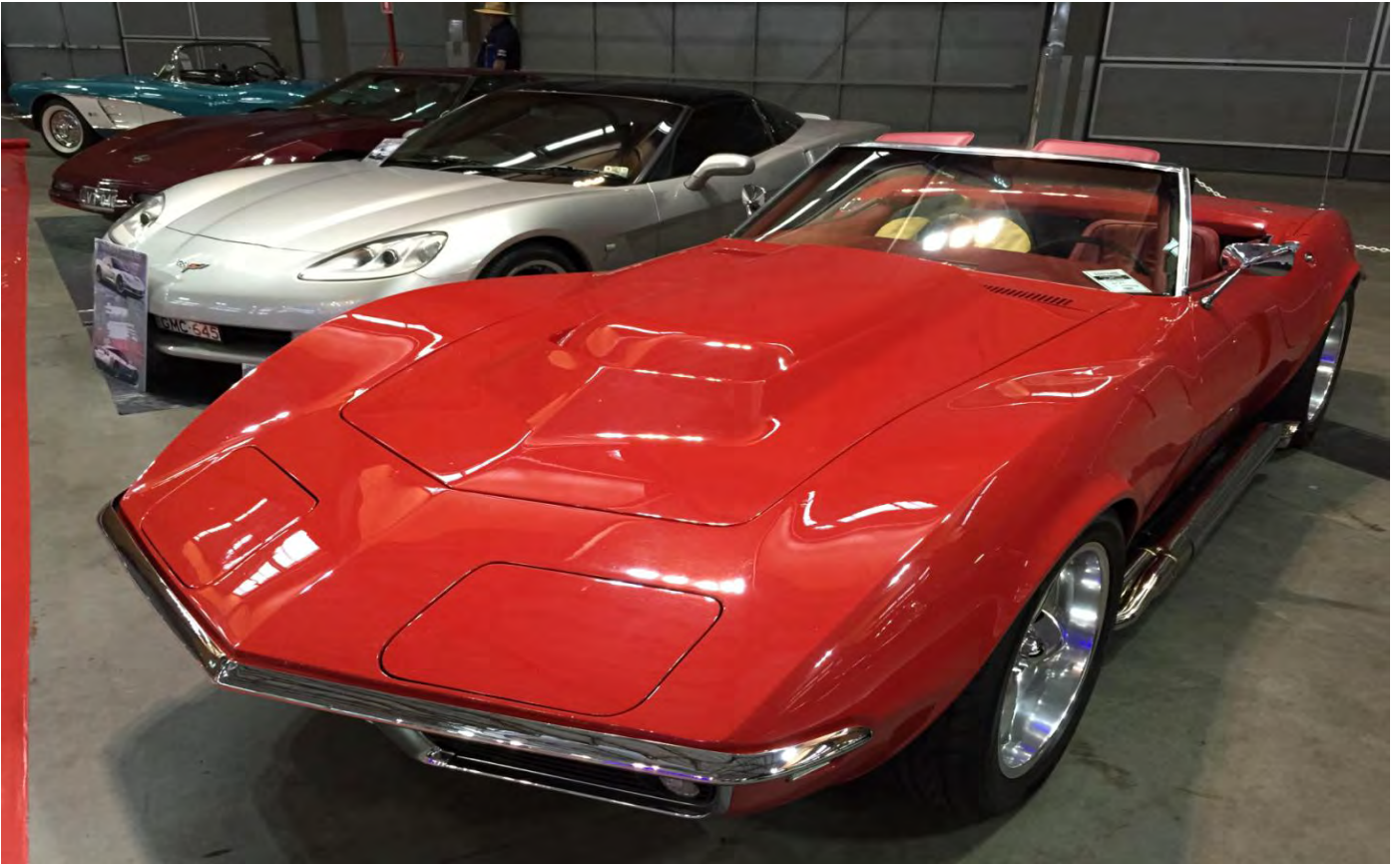
Warren's 68 C3 and Harry's Grand sports