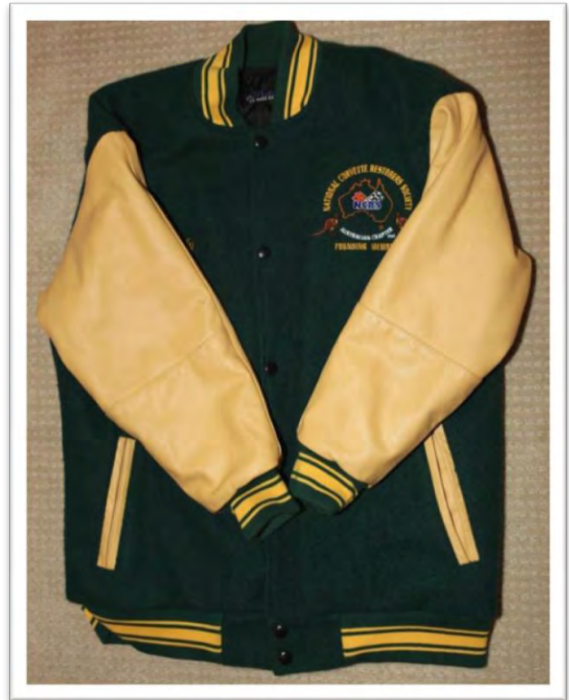
LEATHER JACKET $300.00