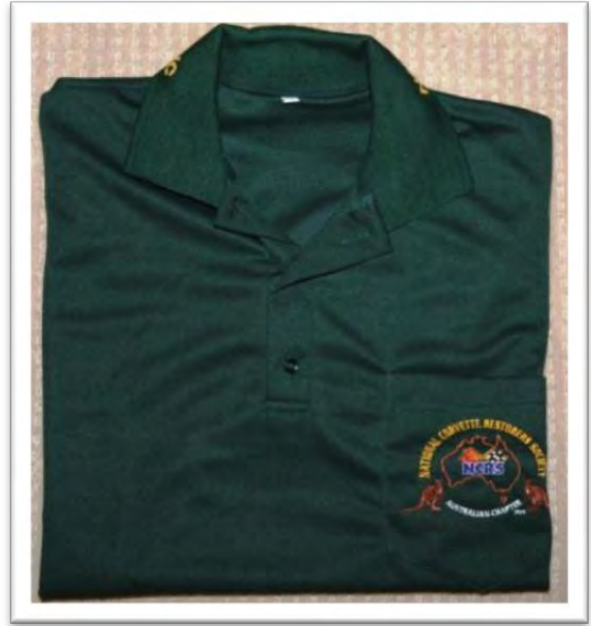
GREEN POLO $ 40.00