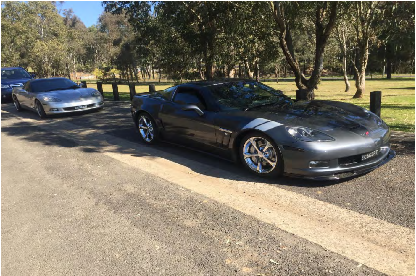
Bob's C6 Grand Sports