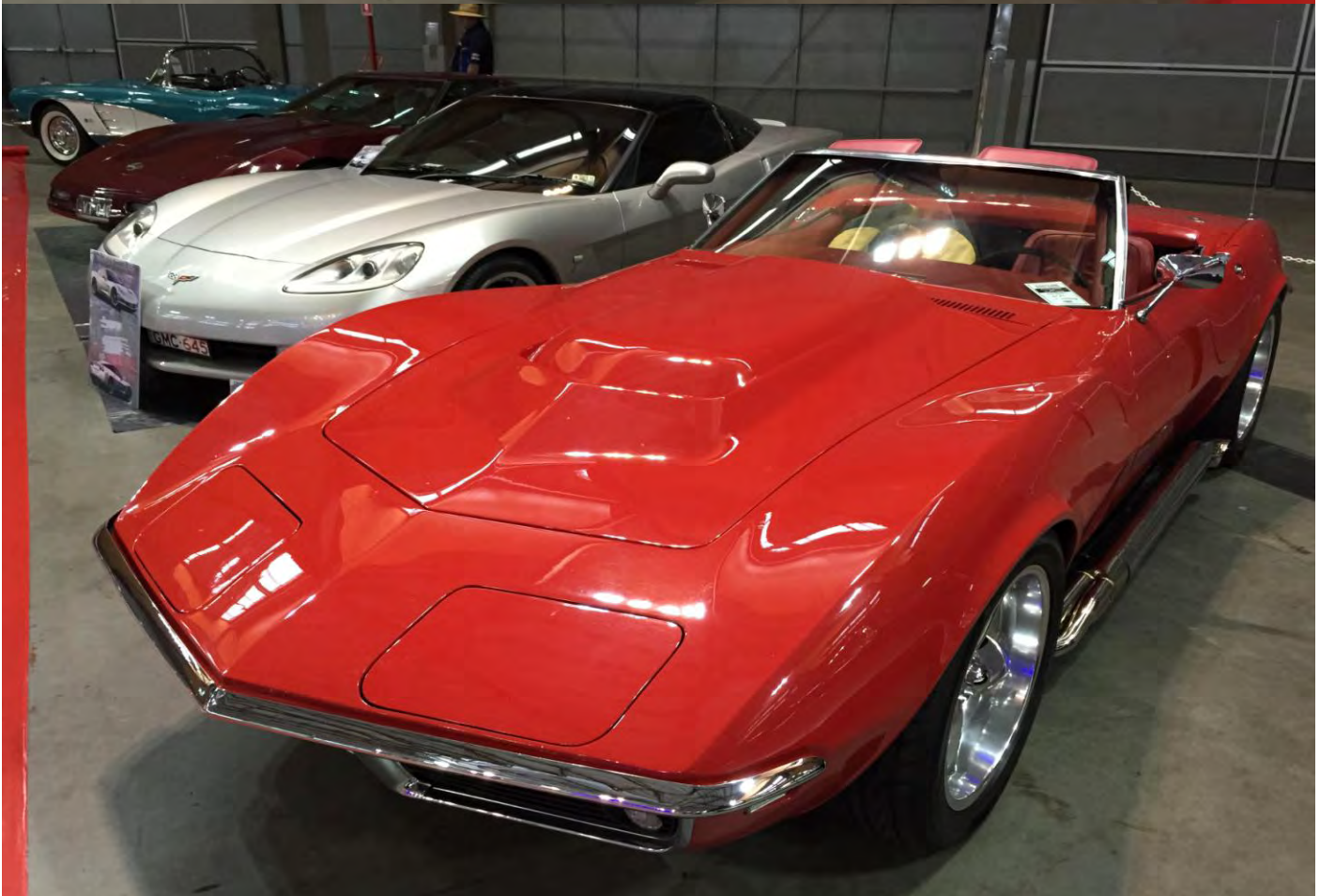
Warren's 68 looking great love the side pipes