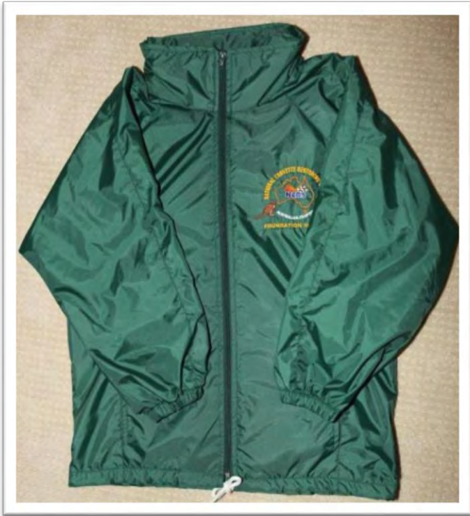
Windcheater Jacket $45.00