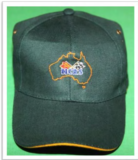
Cap $ 15.00