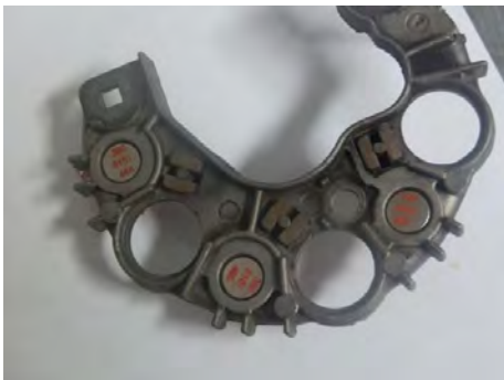
New positive diodes

Some diodes in this alternator measured open circuit and some measured short circuit. All diodes were replaced.