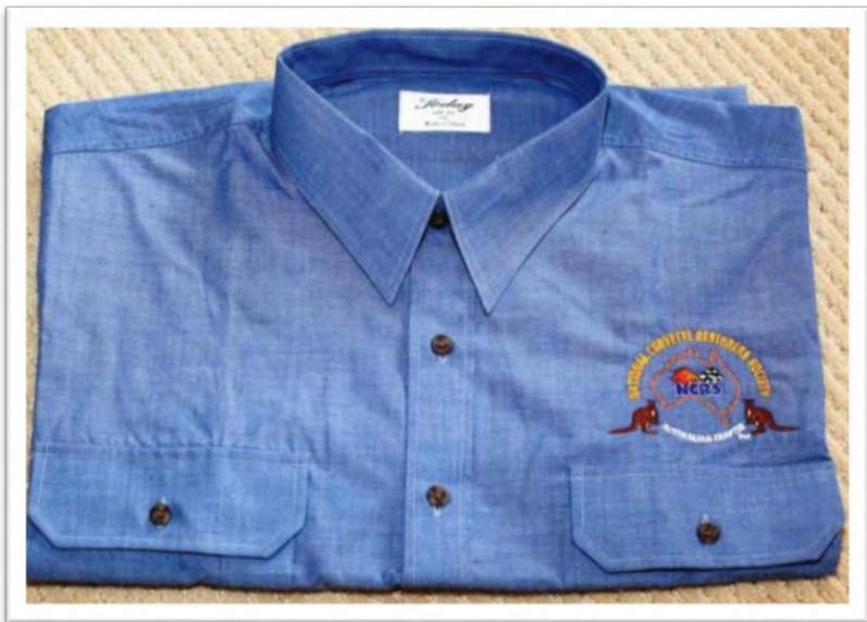
Blue Denim $35.00