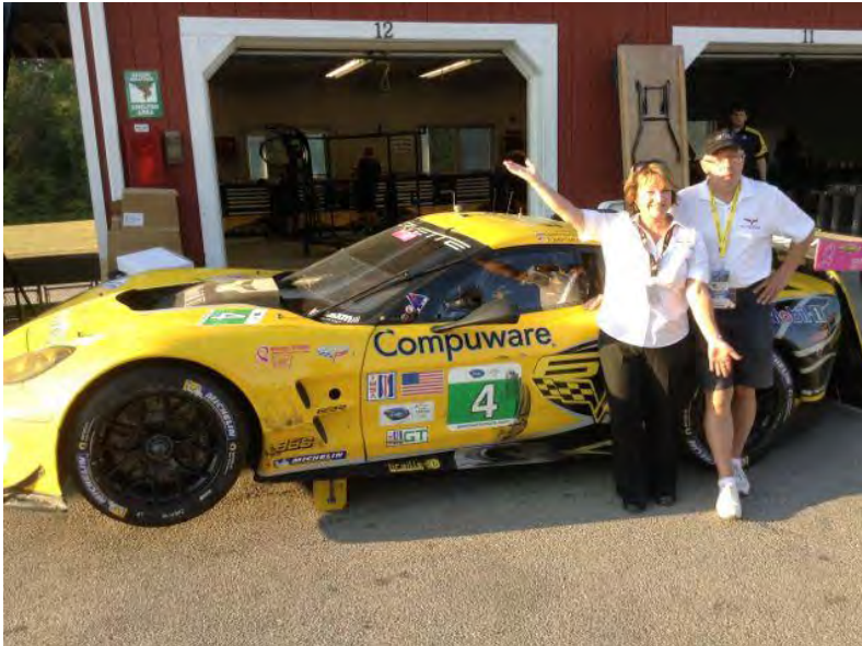
Corvette being prepared for the new 2014 United SportsCar Championship.