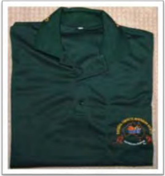
Green Polo $ 40.00