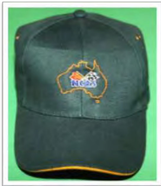
Cap $ 15.00