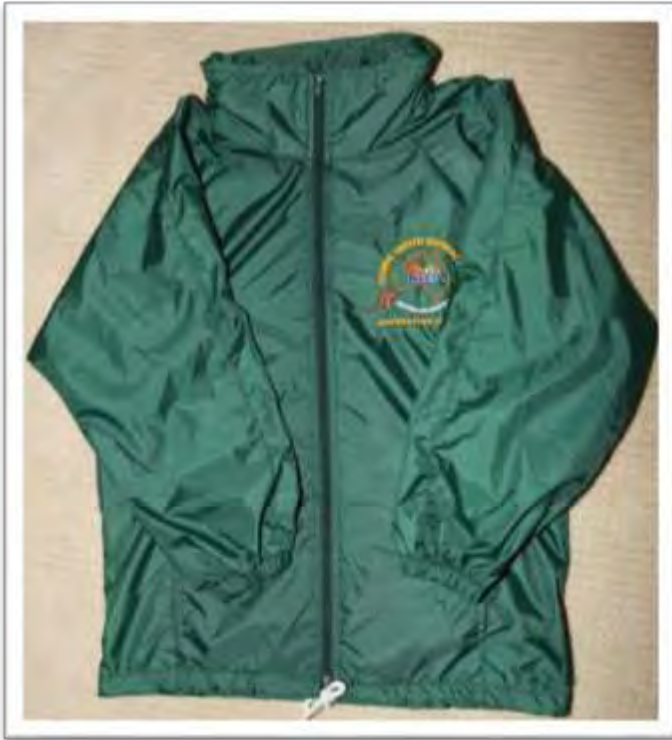
Windcheater Jacket $45.00