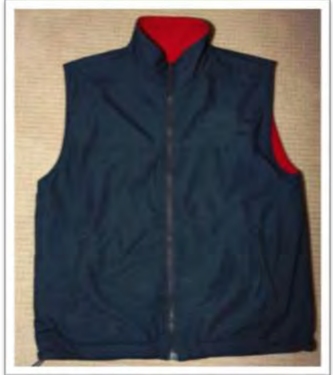
Woollen Vest $38.00