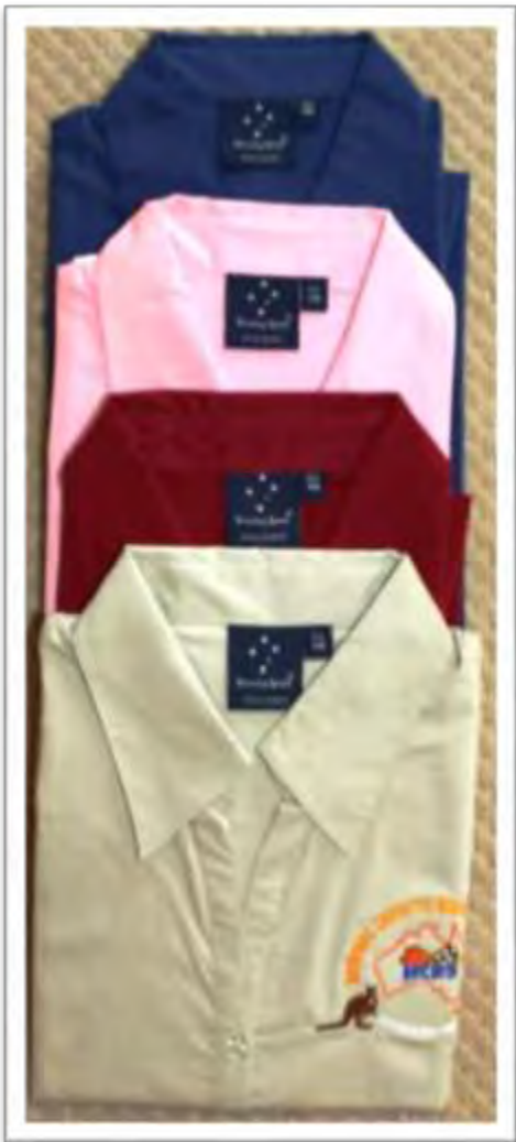
Ladies Shirts $ 35.00