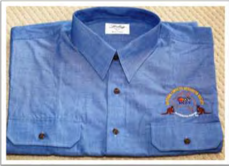
Blue Denim $35.00