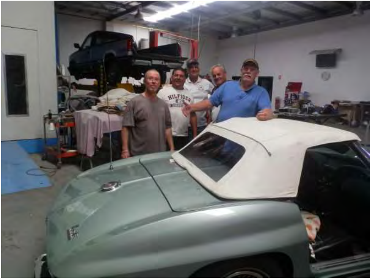
Then it was beer o'clock.