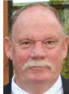
Web Master: Gary Cowans