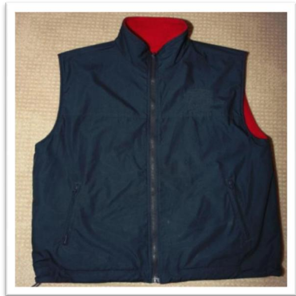
WOOLLEN VEST $38.00