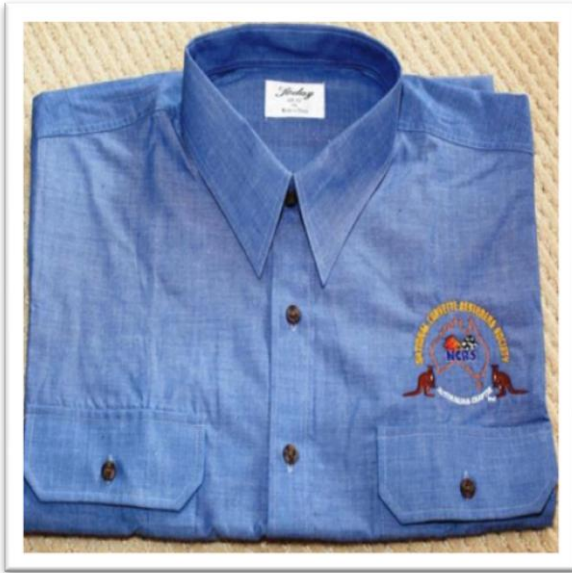
BLUE DENIM $35.00