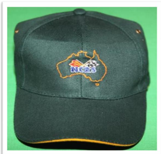
CAP $ 15.00