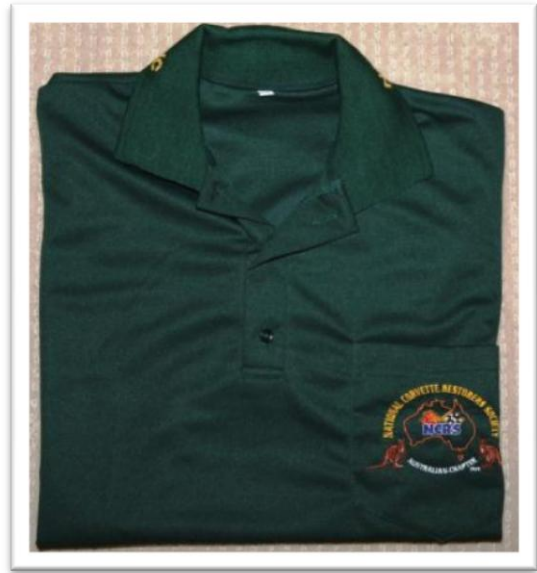
GREEN POLO $ 40.00