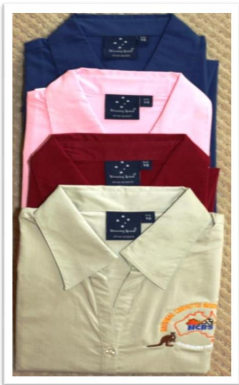
LADIES SHIRTS $ 35.00