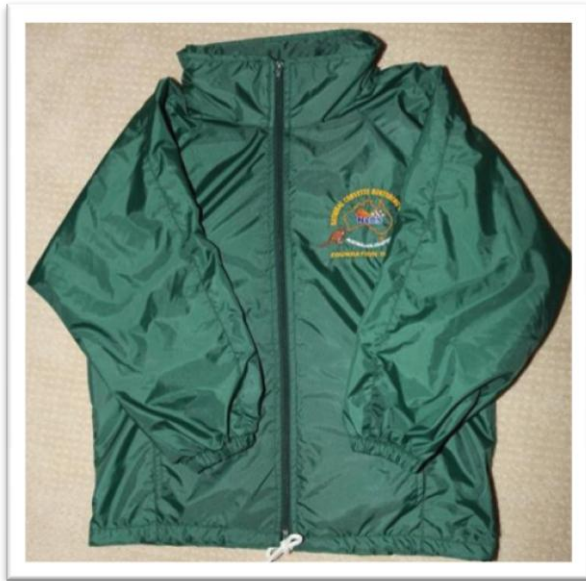
WINDCHEATER JACKET $45.00