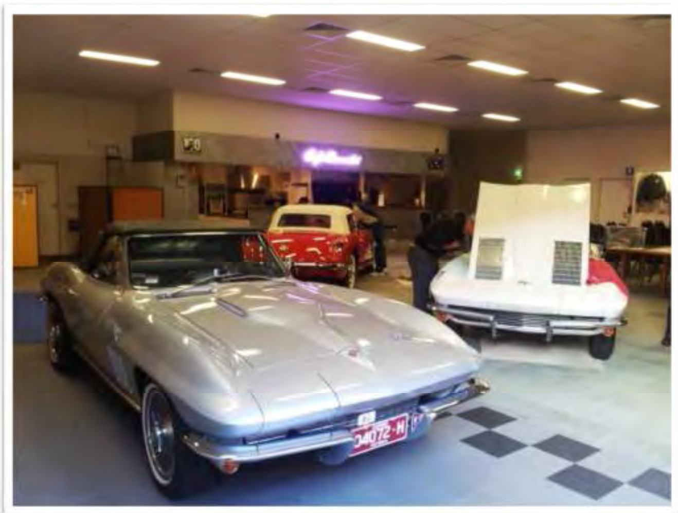
Lou Rokas 66 on Sportsman Display along with the other cars being NCRS judged