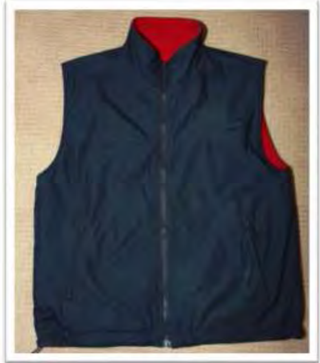
WOOLLEN VEST $38.00