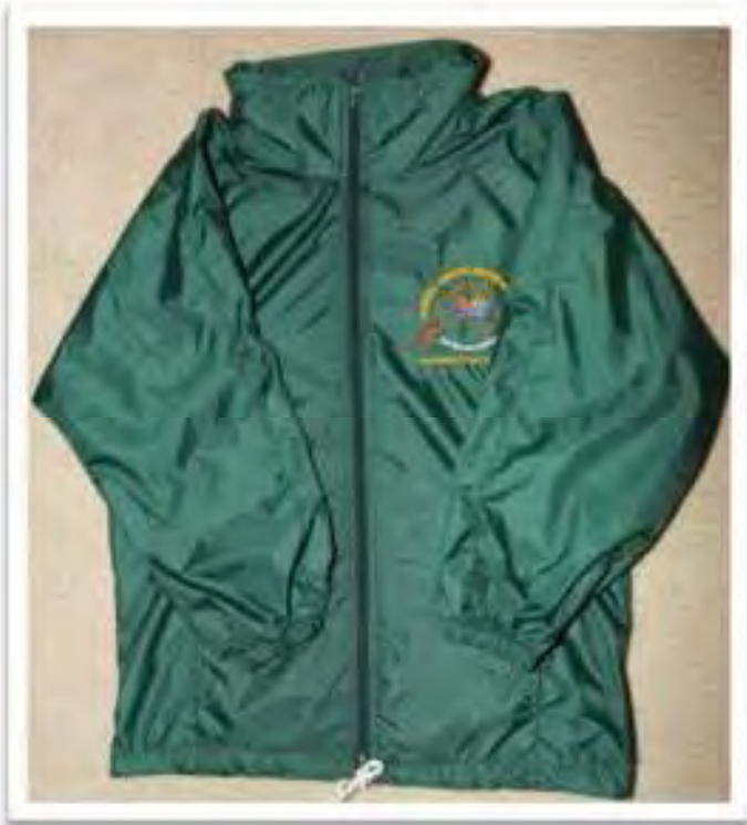
WINDCHEATER JACKET $45.00