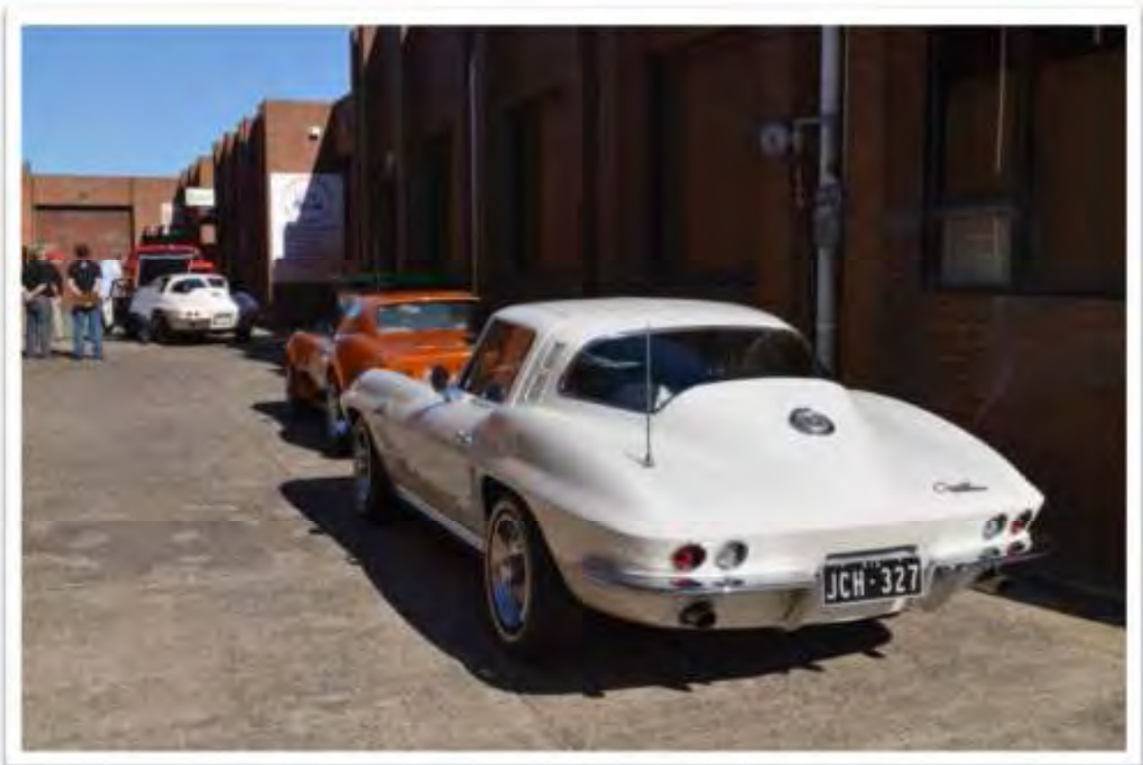
A few of the folk attending on the day