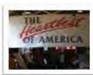
Richard Stones (photo coming)