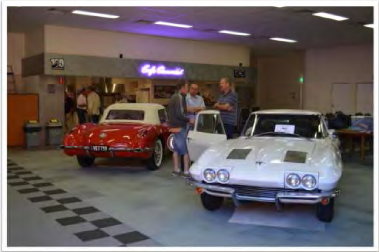
Things get underway