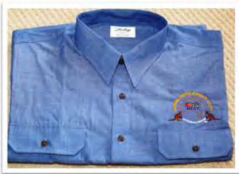
BLUE DENIM $35.00