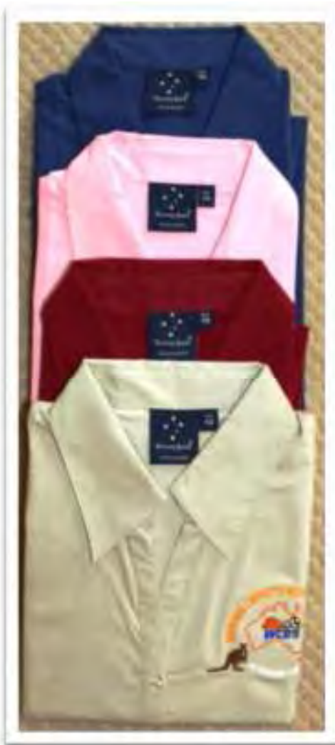
LADIES SHIRTS $ 35.00