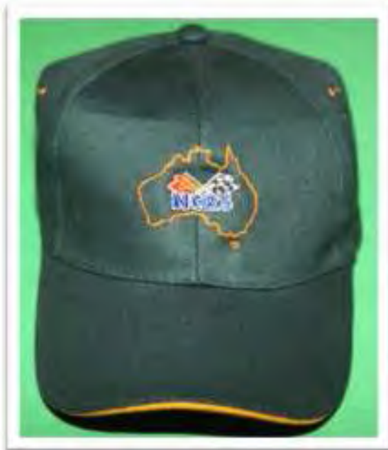
CAP $ 15.00