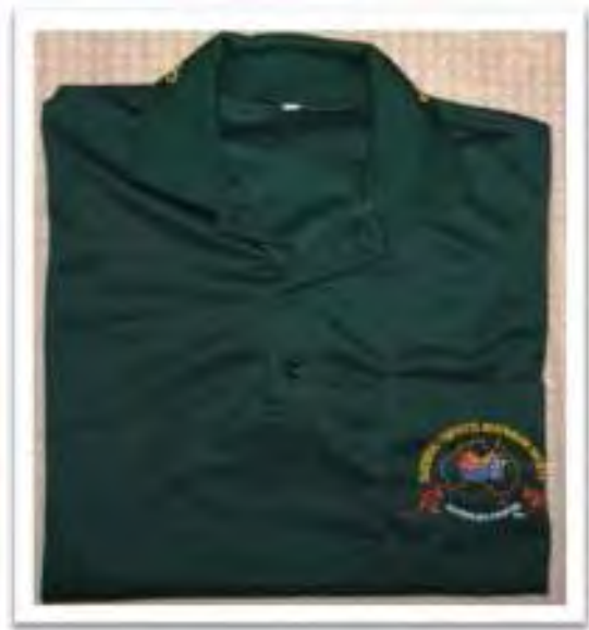
GREEN POLO $ 40.00