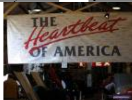
VIC: Louis Rokas (photo coming)