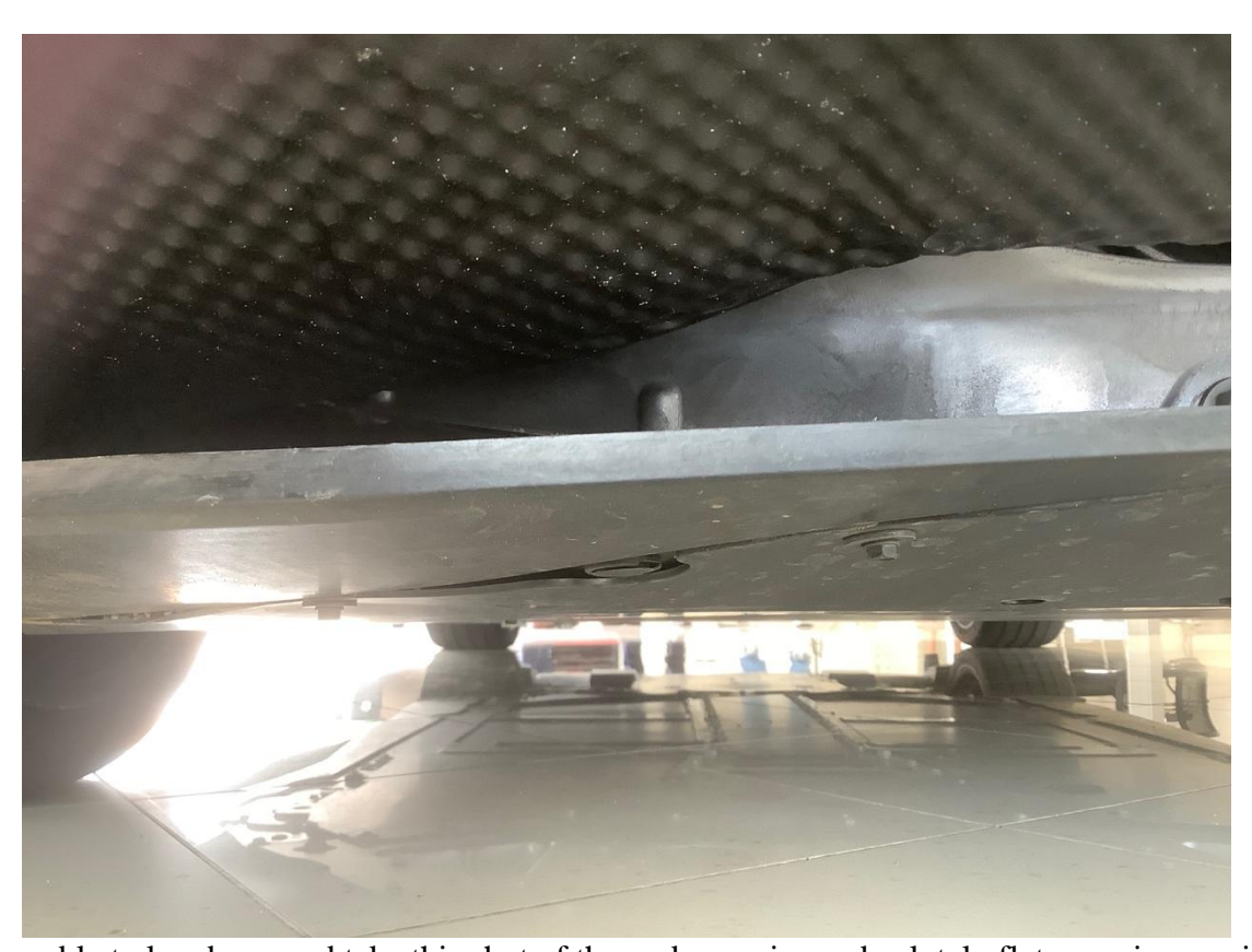
I was able to lay down and take this shot of the under carriage, absolutely flat, very impressive.