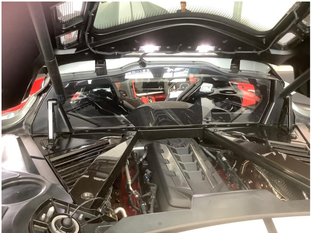
As you can see, they have really squeezed the engine into this compartment. The use of the carbon fibre really finishes the engine bay off.