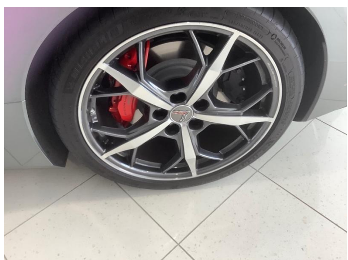
Front: 245 x 35 x ZR19