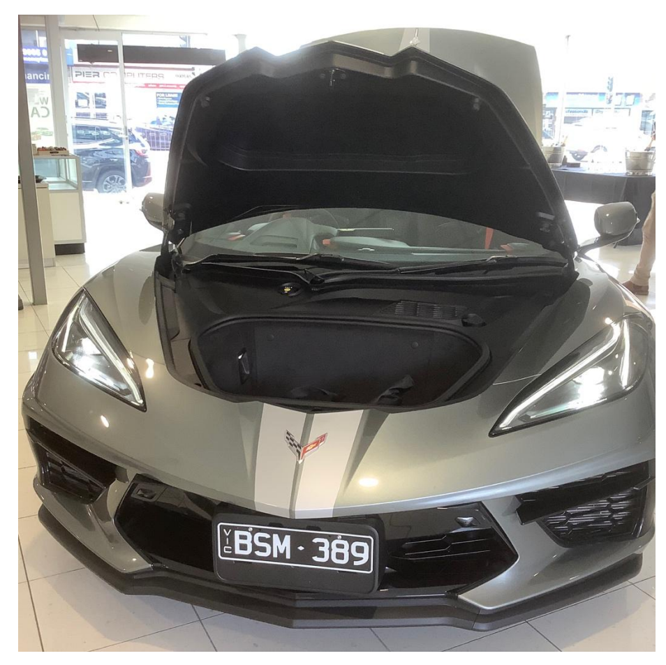
Oct Nov Dec 2021 Page 15 of 39