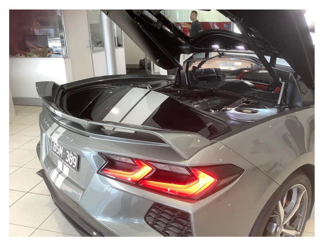
The rear trunk, even with the hard top in it, there still was space under it.