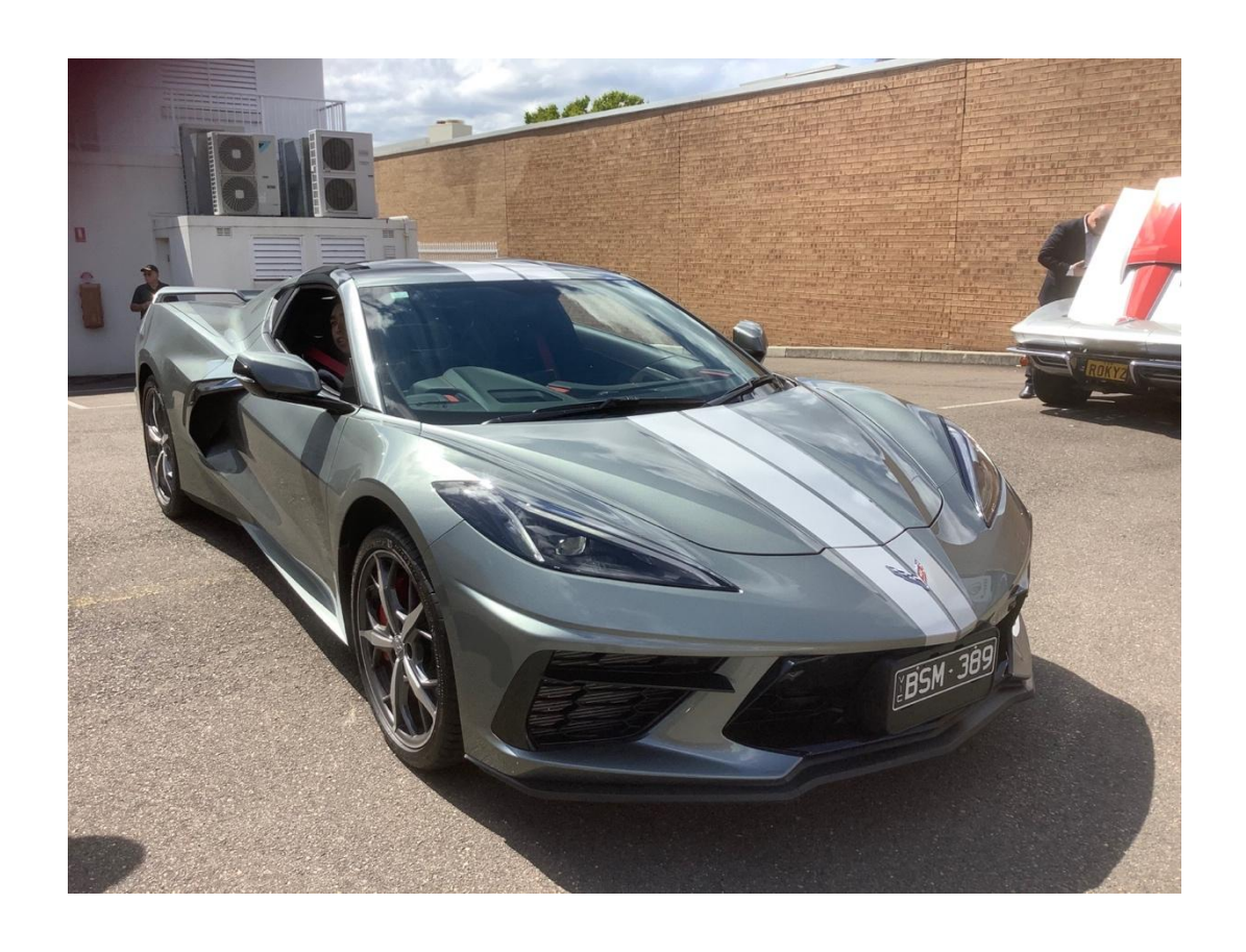
Right hand drive C8 release in Australia