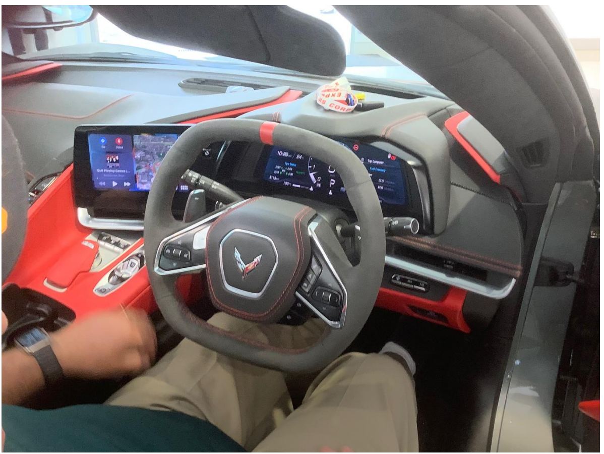
Oct Nov Dec 2021 Page 10 of 39