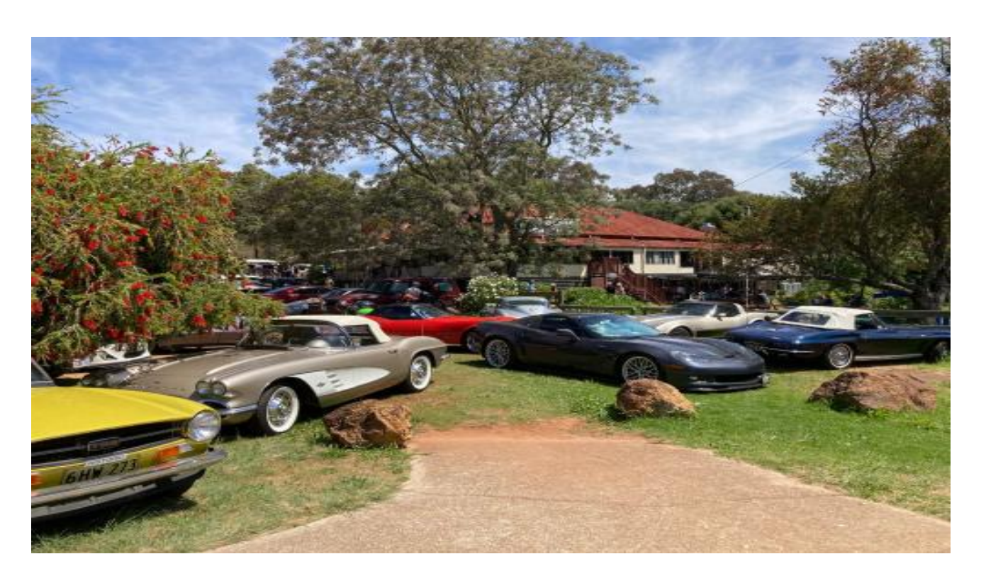
This made parking a little difficult, but we managed to fit in.