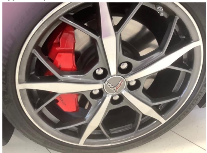
Rear: 305x 30 x ZR20