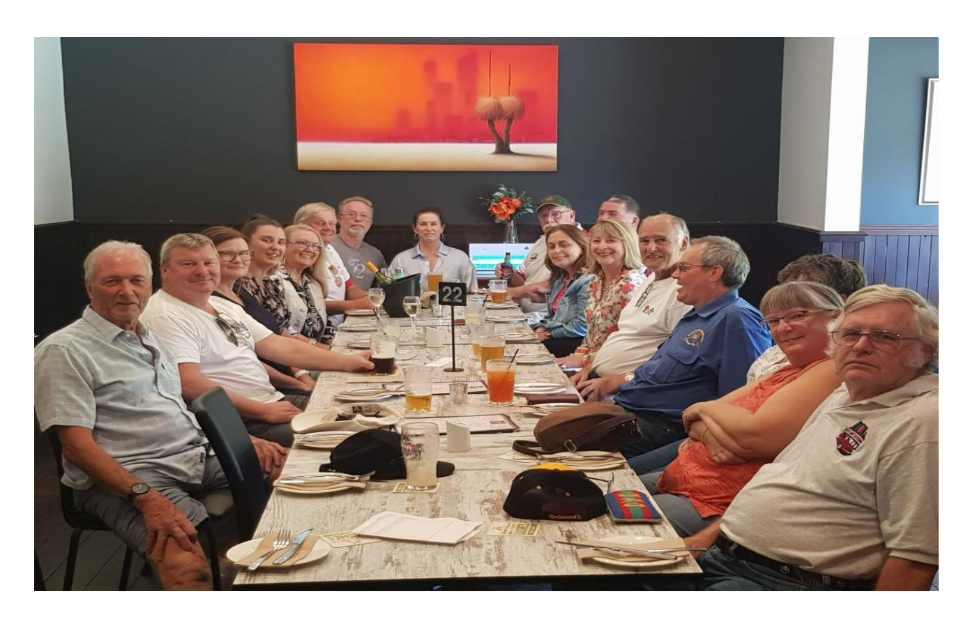
Oct Nov Dec 2021 Page 29 of 39