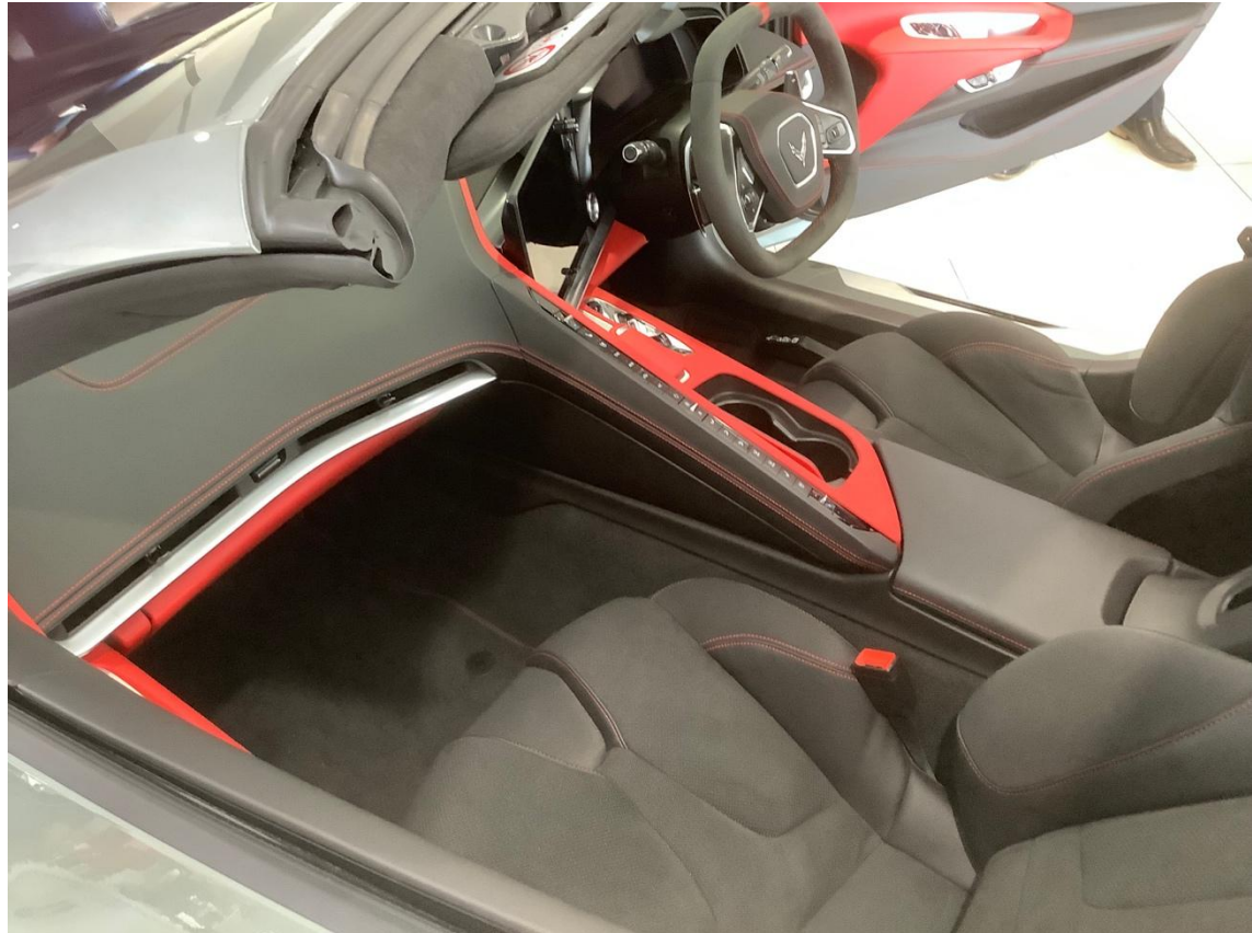
As you can see, lots of room on the passenger side.