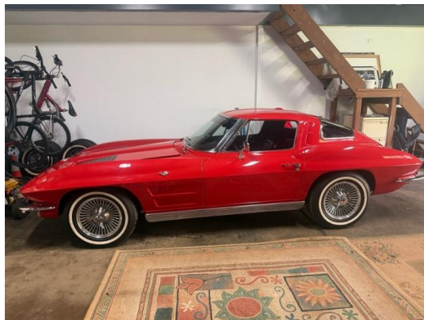
Dusty's Fantastic 1963 Split window Coupe